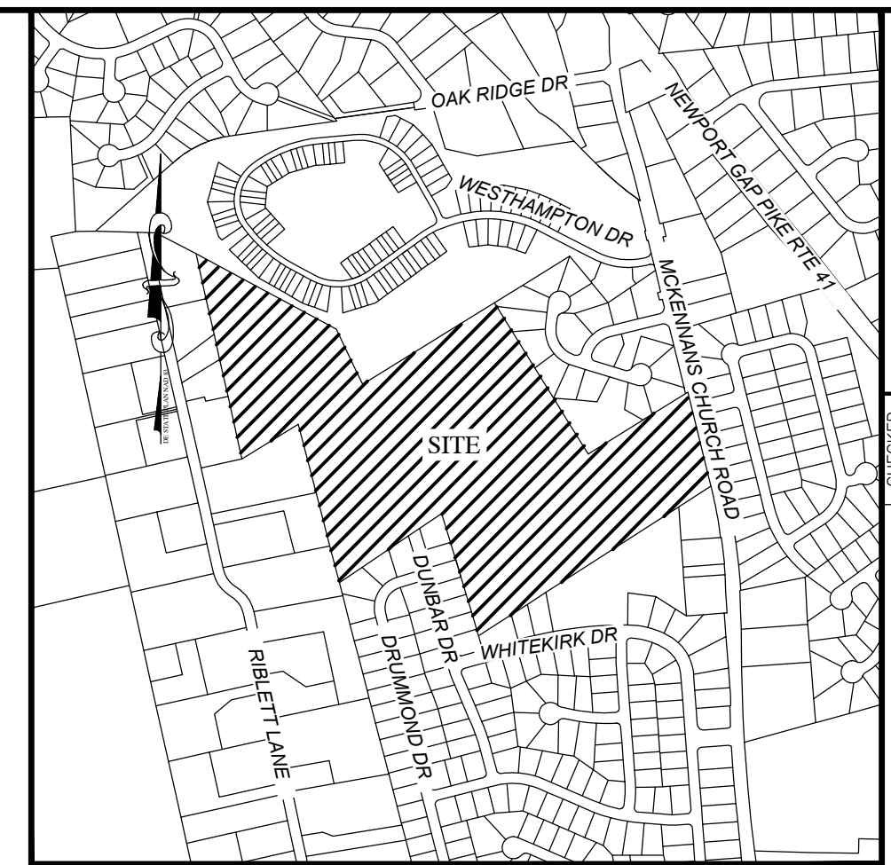
KEY MAP 1"=800'