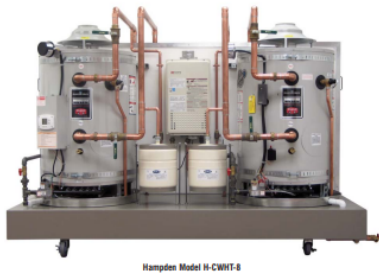
Hampden Model H-CWHT-8

NOTE: IMAGE IS FOR REFERENCE ONLY, AND MAY NOT ACCURATELY DEPICT FINISHES ETC. REFER TO SPECIFICATION FOR DETAILS.