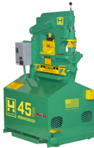
* Shown with optional Slug Type Angle Shear

NOTE: IMAGE IS FOR REFERENCE ONLY, AND MAY NOT ACCURATELY DEPICT FINISHES ETC. REFER TO SPECIFICATION FOR DETAILS.