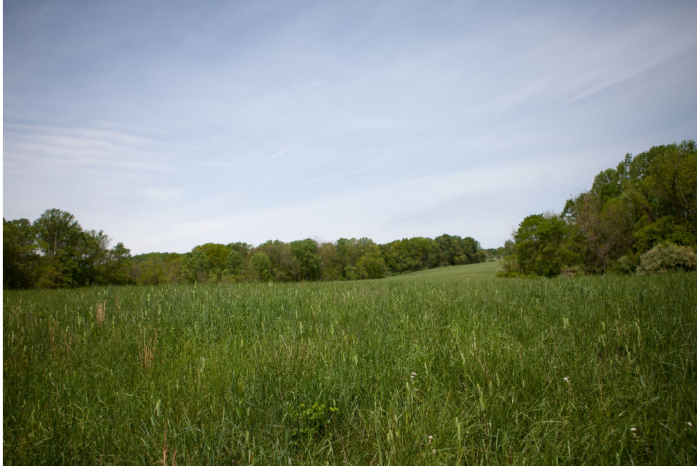
Photo: White Clay Creek State Park meadow