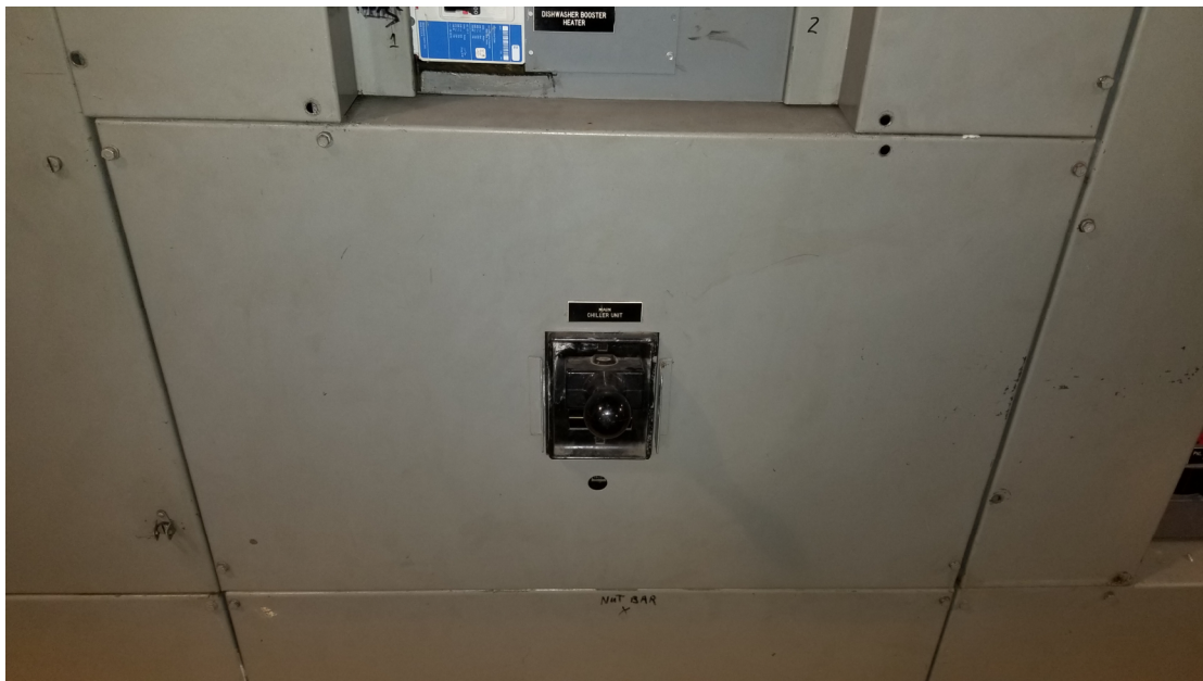
Photograph #2 – Main Chiller Unit 1600A Circuit Breaker

1220 East Joppa Road Suite 223 Towson, Maryland 21286 TEL 410.832.2420 FAX 410.832.2418