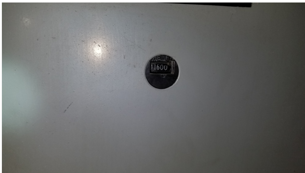
Photograph #4 – Main Chiller Unit Circuit Breaker Rating