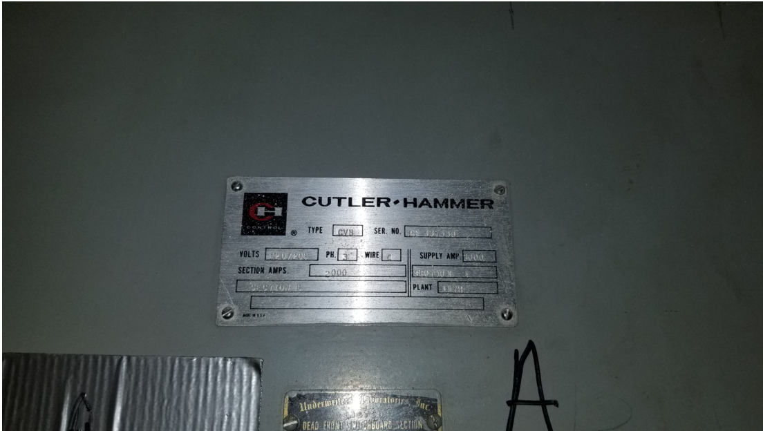
Photograph #1 – Switchboard Nameplate Data