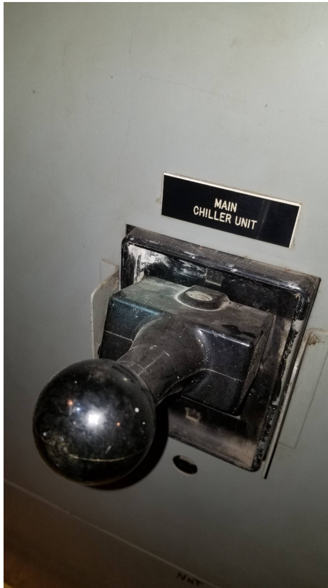
Photograph #3 – Main Chiller Unit Circuit Breaker