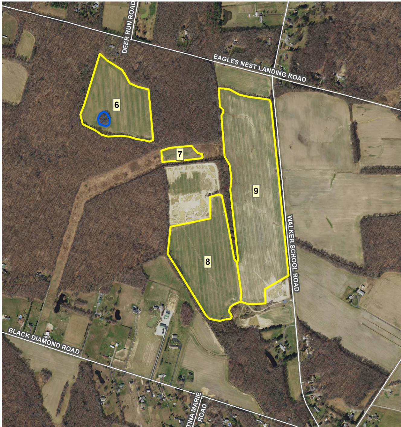
Exhibit 2. Aerial view of Eagles Nest Wildlife Area – Eastburn Tract, near Townsend, Delaware.