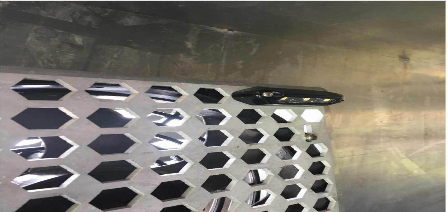
Kennel Light (close up)