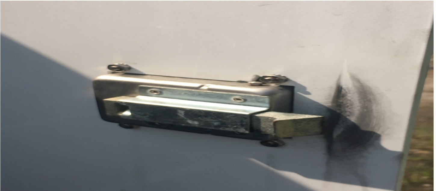
Door Latch 1