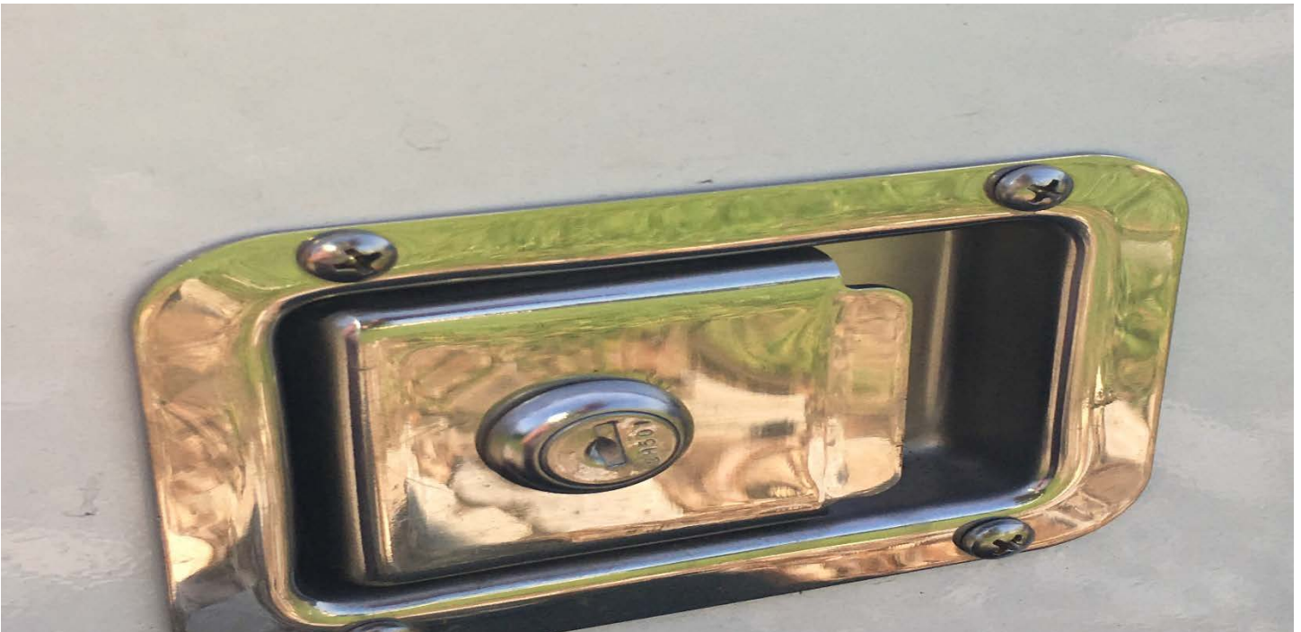
Door Lock 1