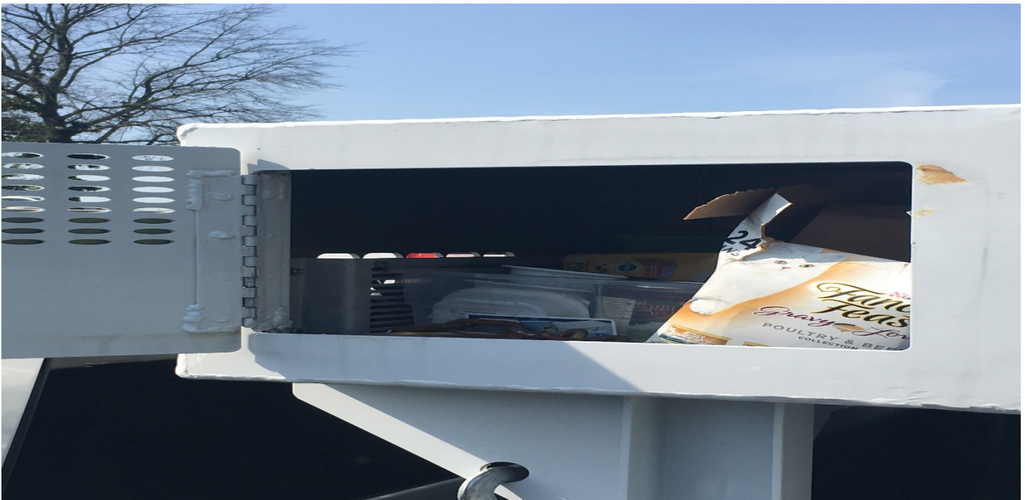
Storage Box View – Driver Side