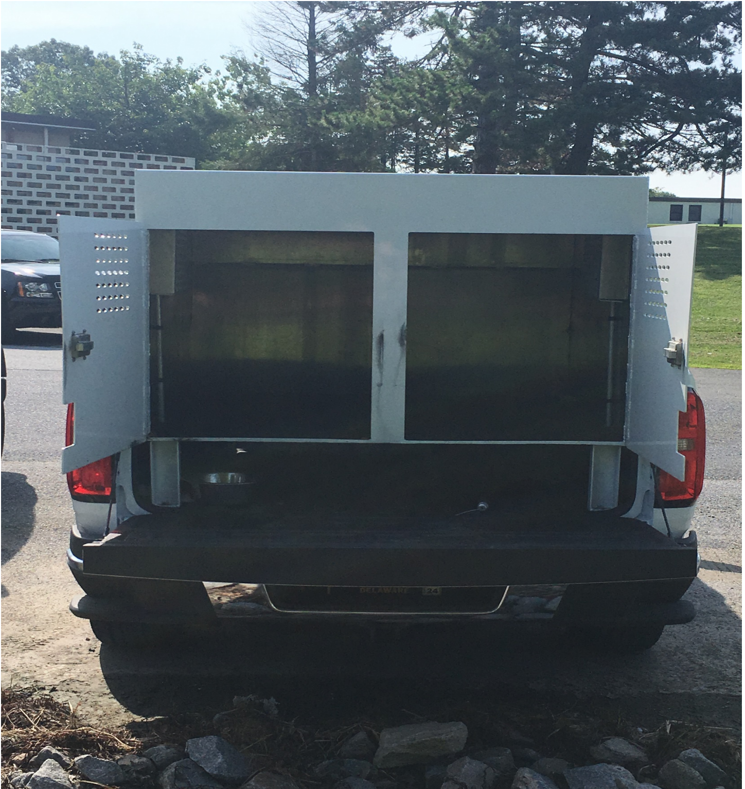
Kennel Rear – Doors Open