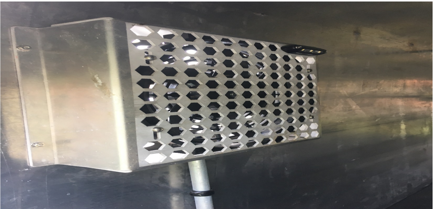
Fan (Inside w/ light in upper right)