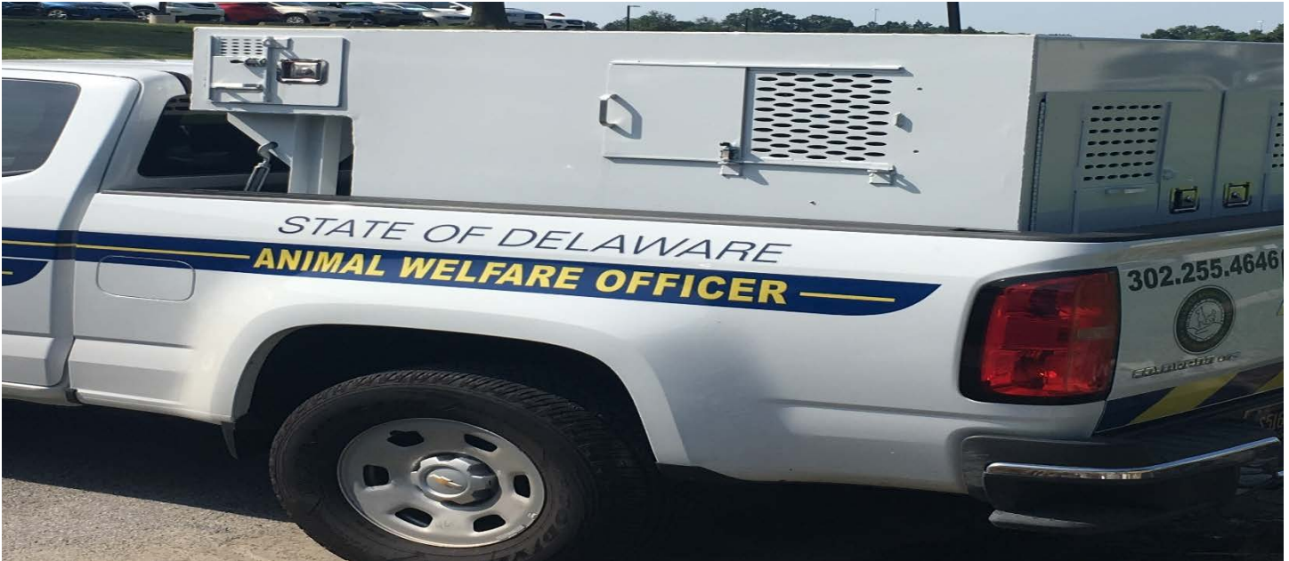
Driver Side View