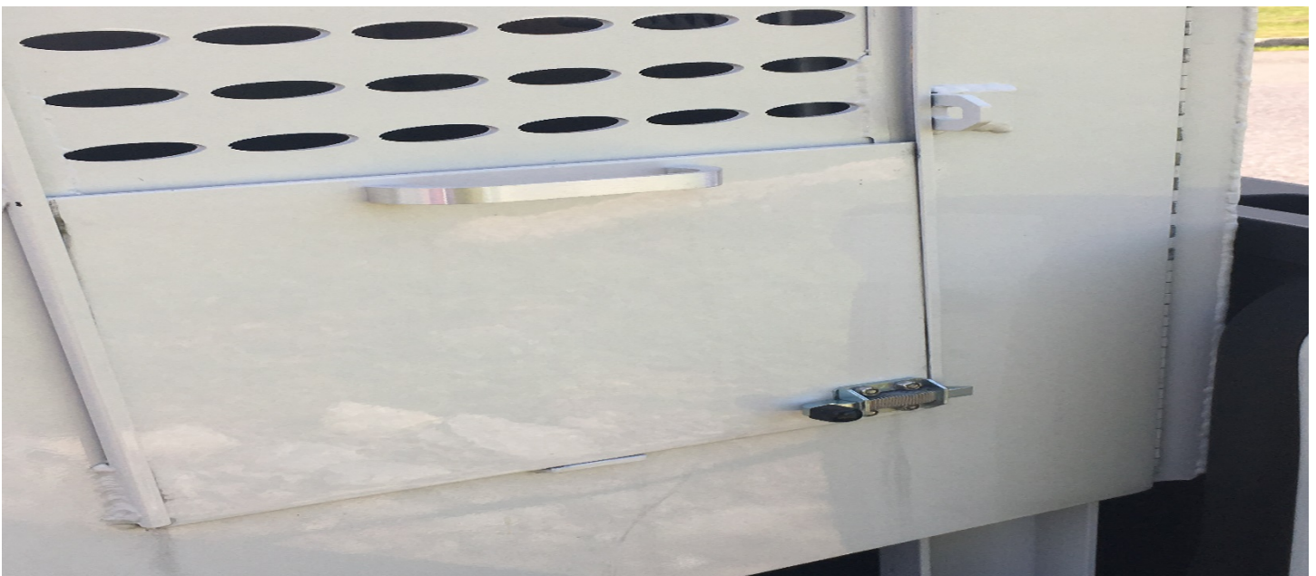
Kennel Rear Door (up close – right door)