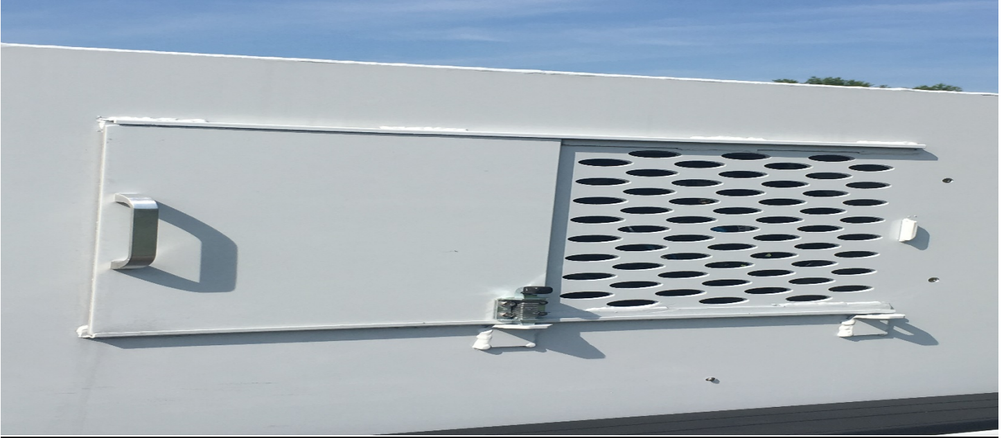
Driver Side Kennel Window w/ Fan