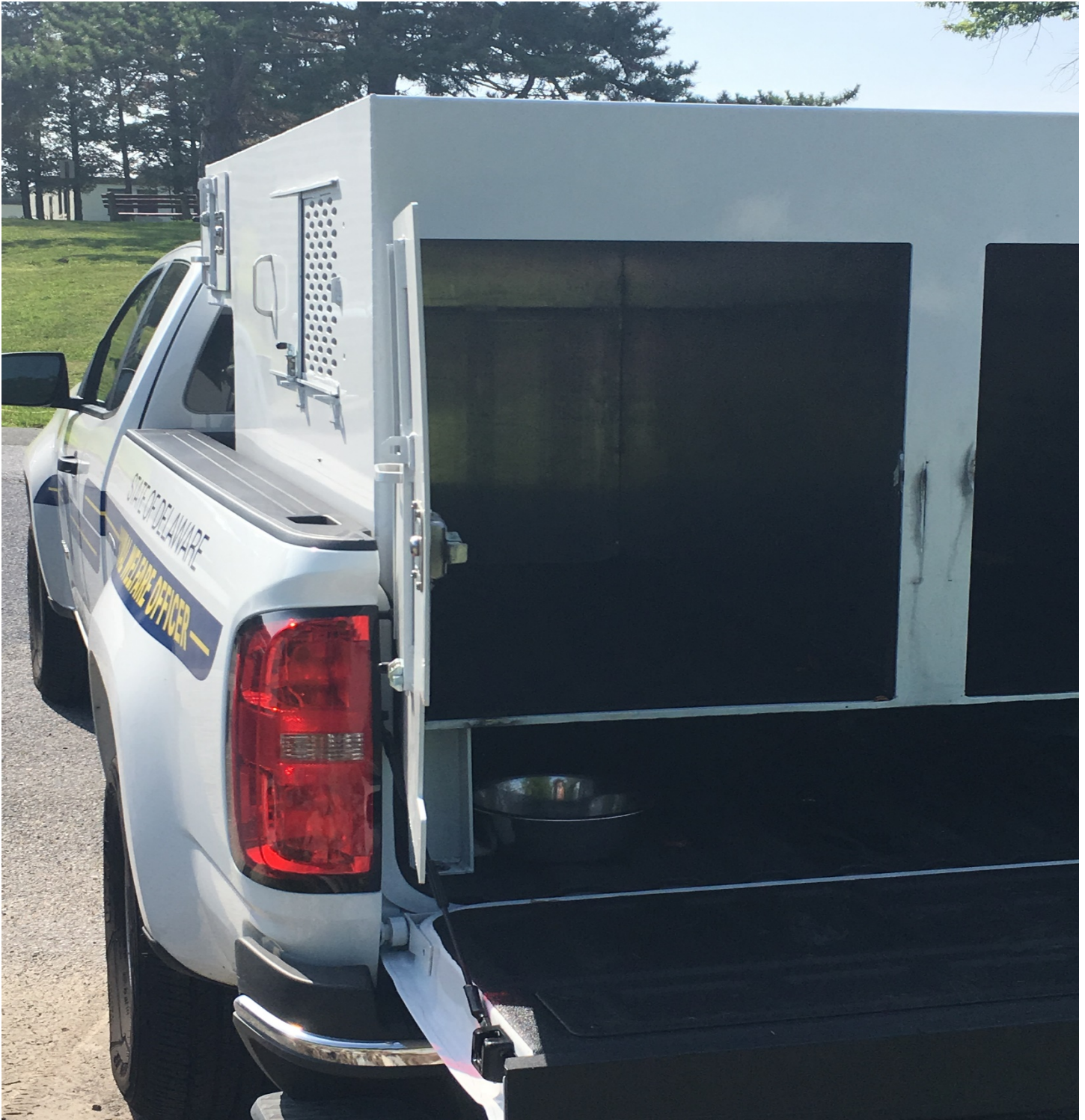
Kennel Rear – Door Open – Left Side