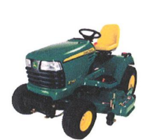
X700 Select Series<sup>™</sup> Riding Mowers Expand the possibilities with our X700 Ultimate<sup>™</sup> Tractor. Tackle anything on any terrain with this versatile mower, which features the 7-Iron II<sup>™</sup> deck or the Edge<sup>™</sup> Xtra Cutting System.

*Engine hp is provided by engine mfr. for comparison purposes only