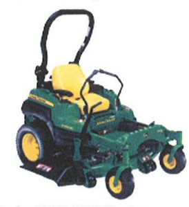
Z-Trak<sup>™</sup> PRO 900 Series Accept nothing less in a zero turn mower than one with a high-capacity 7-Iron<sup>™</sup> PRO mower deck, reliable integrated ground drive transmission, and innovative Brake and Go<sup>™</sup> system for simpler starting.