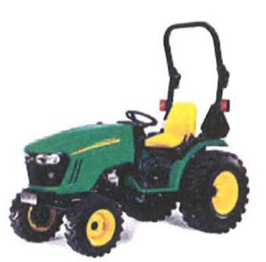
2000, 3000 and 4000 Series Tractors

foot cargo box that has 20 tie-down points and converts to flat-bed mode in minutes. Electric models available.