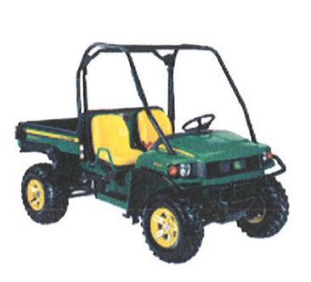
Gator" XUV 4X4 850D The Gator XUV is your choice for greater speed. As the fastest diesel on the market, it quickly accelerates to a top speed of 30 mph. Combine its impressive speed with independent rear suspension and you are in for one superior ride on even the roughest terrain.