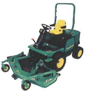
1400 and 1500 Series II Full-Size Front Mowers These versatile, high-capacity mowers are best in their class. Available in two- and four-wheel drive with a wide variety of attachments, advanced safety features, cast-iron axles, 7-Iron II<sup>™</sup> decks, and self-reinforcing frames.