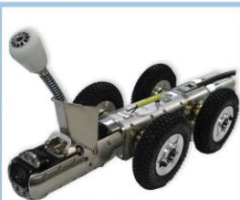
LATERAL & MAINLINE INSPECTION

All CUES systems are proudly made in America!