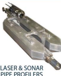
LASER & SONAR PIPE PROFILERS