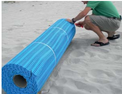
PathMat™ Beach Access Mat - Rolled