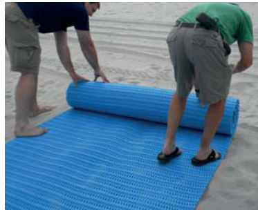
Un-rolling prior to installation