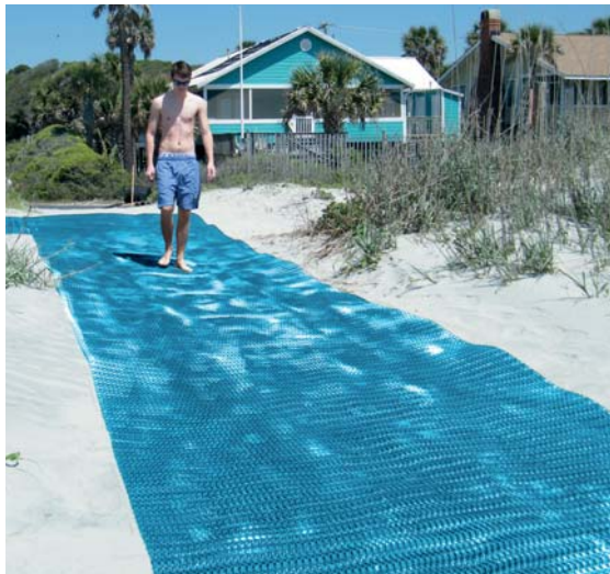
PathMat™ Beach Access Mat used for a beach access walkway

PathMat™ Beach Access Mat can be used in a multitude of applications - wherever recreation access is required for walking and wheelchair accessibility. The mat is also able to be cut and formed around existing beach structures in addition to protected native beach dunes.