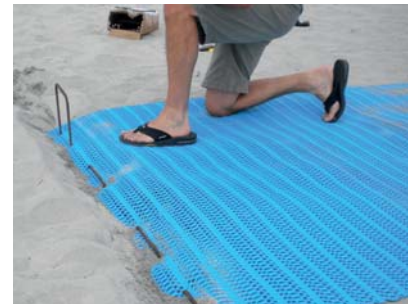
Pinning down the ends